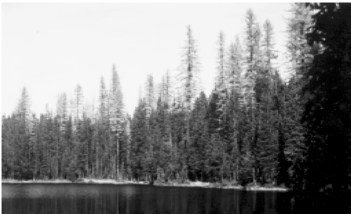
Figure 1 —A stand on the Lolo National Forest, Montana, shaped by a mixed-severity fire regime. The tall trees (western larch) were established after various fires between the mid-1400s and the early 1800s. The older larch have survived 4 to 5 fires between the mid-1600s and 1904. A few of the lodgepole pines survived fires in 1889 and 1904, but most of the densely stocked smaller trees (lodgepole pine, subalpine fir, and Engelmann spruce) became established after these latest fires (S. Arno, unpublished data).

Forests associated with mixed-severity regimes were often dominated by the early seral, fire-dependent tree species, but also may have had a substantial component of late-successional trees. Individual stands were often uneven-aged and multi-layered. Moderately short fire intervals allowed important seral shrubs and hardwoods to remain