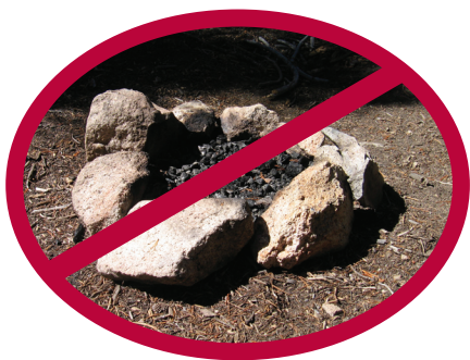
NO FIRE RINGS