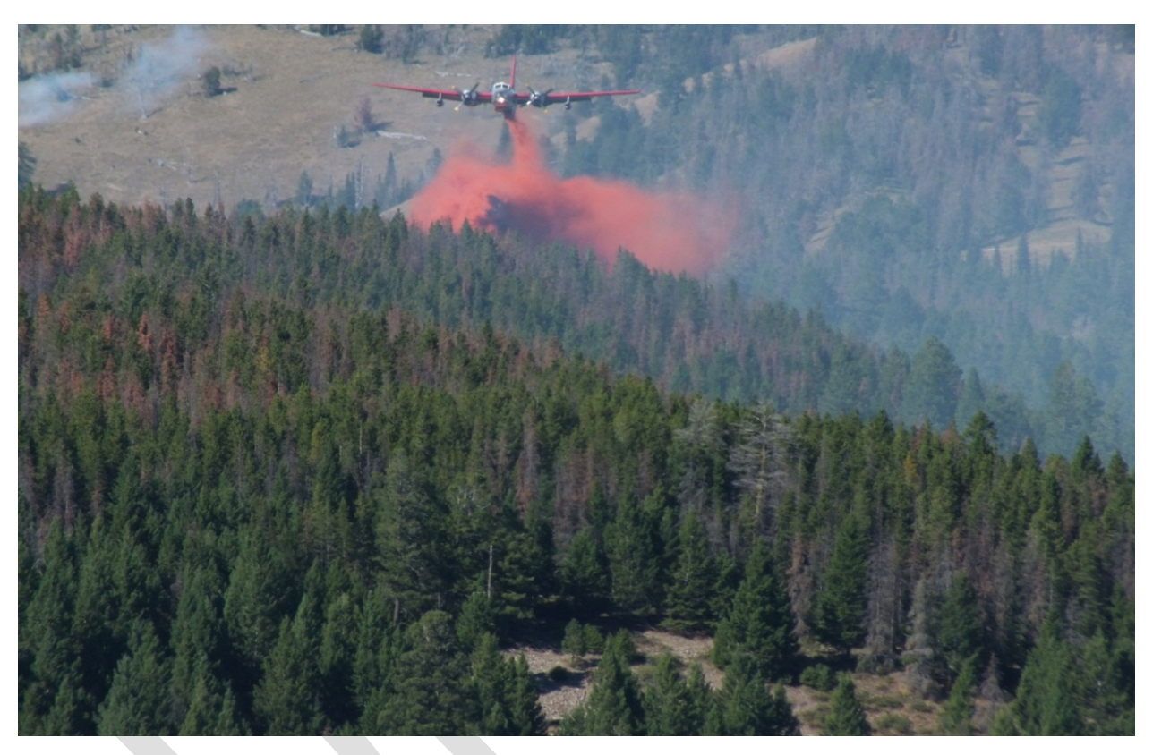
Nez Perce Fire 2013

Interagency Federal fire policy requires that every area with burnable vegetation must have a Fire Management Plan (FMP). This FMP provides information about the fire management planning process for the Salmon/Challis National Forest and compiles guidance from existing sources such as but not limited to, the Salmon and Challis National Forest Land and Resource Management Plans, (Salmon: 1/1988, Challis: 6/1987) national policy, and national and regional directives.