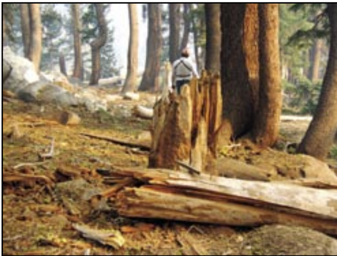
Figure D–18a—This stump appears to have been broken off naturally, helping to maintain the wilderness character.

Relying on blasting rather than using crosscut saws to fell snags allowed the natural wilderness character to be maintained. If the trees had been felled with crosscut saws, saw marks would have been left on the trees. Motorized equipment was not considered.