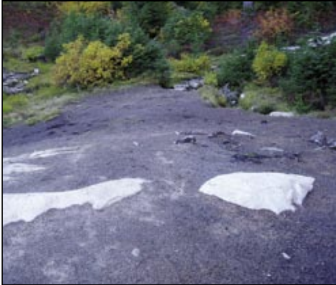
Figure D-2—Fragile sites, such as this campsite at Lake Valhalla, are easily degraded.