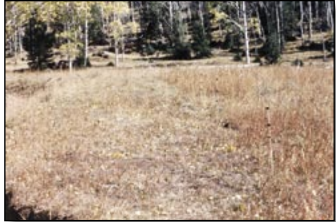
Figure D–8—Commercial livestock were rotated between three pastures separated by electric fences.

We have experienced fairly good success with the electric fence, although at first we did have some vandalism and some visitors let the fence down so their stock could graze inside. It took some time to change the attitude of some visitors and ranchers so they could accept the fence and the idea that the fence was going to stay. I think persistence and patience on our part have been the reasons for their change of attitude. We also have tried to explain the project’s goals to visitors. In the past few years, folks have begun to accept and support the project.