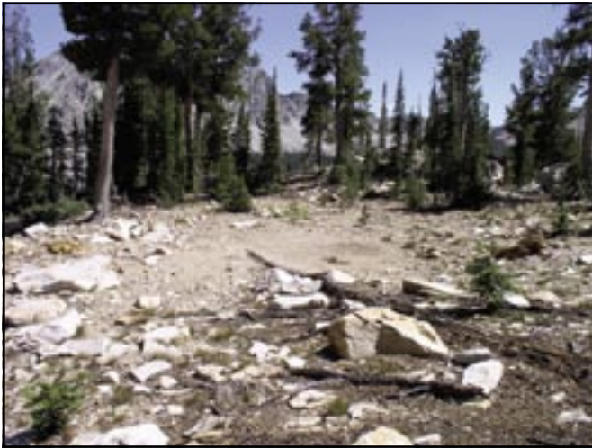
Figure D-11—This campsite was opened after five others in less suitable areas were closed and rehabilitated.

created so visitors could find it. A small area of one of the reclaimed sites was left unaltered to allow a highline to be placed where day riders could tie their stock. An access to the lake was left through another reclaimed site.