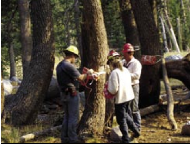
Figure D-19—Strapping explosives to trees.