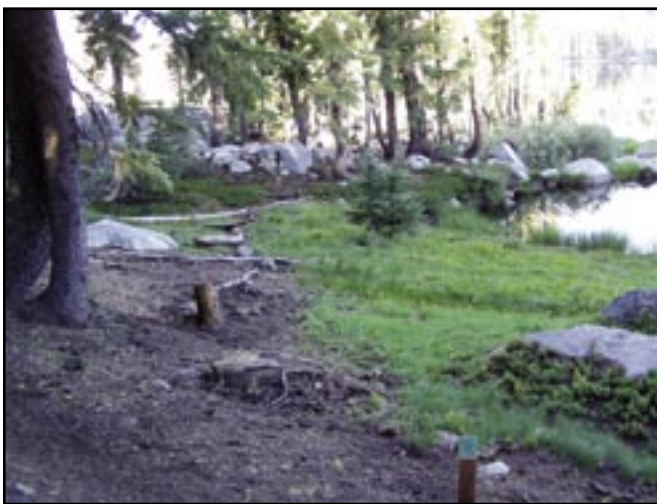
Figure D–17b—Temporary signs were installed at access trails and campsites to keep visitors from trampling the restoration site.

This was particularly important because the designated campsite restrictions were not in place before the restoration work was completed.