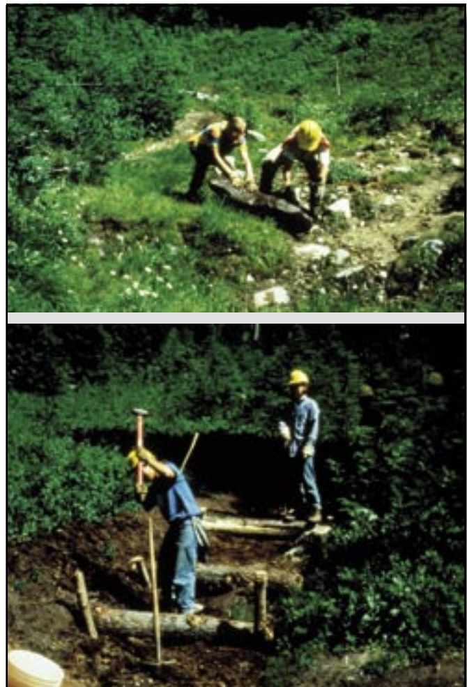
Figures D-3a and 3b—Teenagers on a Student Conservation Association high school work crew spent many hours installing and backfilling rock (top) and installing log checkdams (bottom) to stabilize erosion at Lake Valhalla.

planting of greenhouse-grown plant stock was successful, but a spring planting failed, probably because of a lack of soil moisture during the summer season. Because of declining budgets and turnover in personnel, ongoing maintenance of signs and stock structures has been a challenge. The campfire prohibition has been put in place. Overall, area conditions are improving because trails and campsites were reconfigured to handle the level of use in a more sustainable fashion.