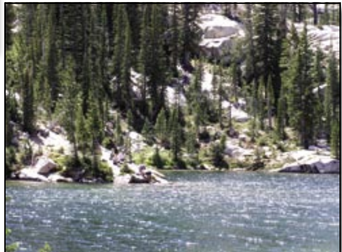
Figure D-10—Edith Lake in the Sawtooth Wilderness, WA.

Edith Lake (figure D-10) was formed by glaciation. The lake sits in a small cirque basin formed in the Idaho batholith at about 8,660 feet (2,640 meters) in the subalpine zone of the Sawtooth Mountains of south-central Idaho. The dominant tree species include lodgepole pine and subalpine fir. Grouse whortleberry is dominant in the understory. Slopes are steep, vegetation is sparse, and soils in this area are predominantly shallow, silty pockets along shorelines or among granitic outcrops. Temperatures are extreme, the growing season is short, and moisture comes predominantly in the form of snow.