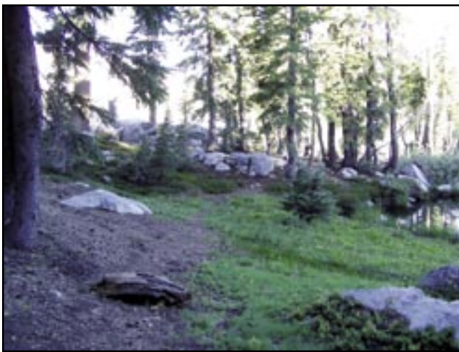
Figure D–17a—Access trails leading to campsites in undesirable locations also need to be closed.