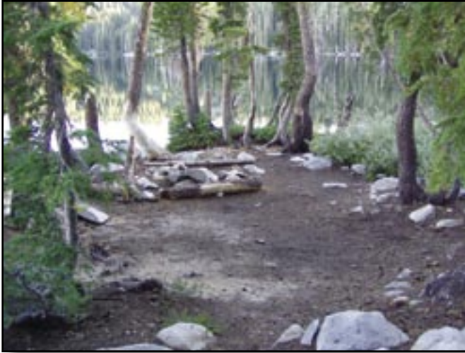
Figure D-15a—Campsites that had the highest impacts were the first to be restored.