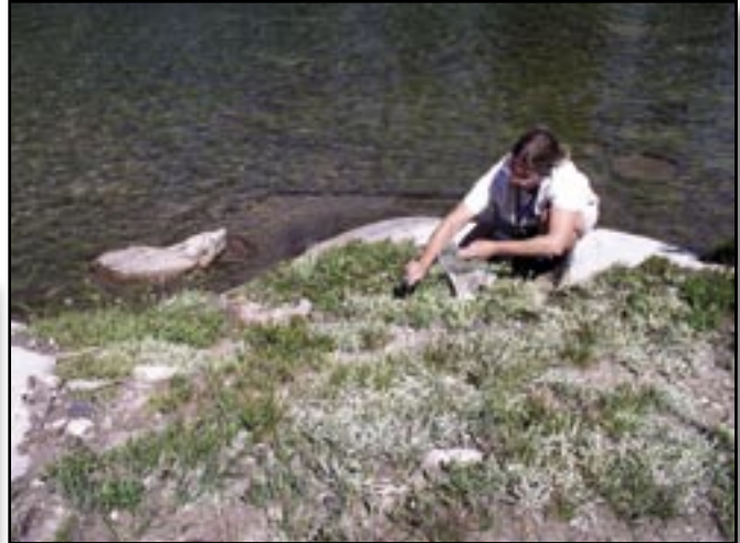
Figure D-12—Gathering seed used to restore vegetation at closed campsites.