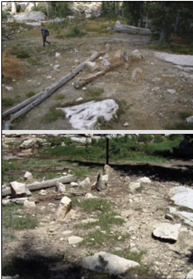
Figures D–13a and 13b—This heavily impacted campsite (top) at Edith Lake has begun to recover (bottom).