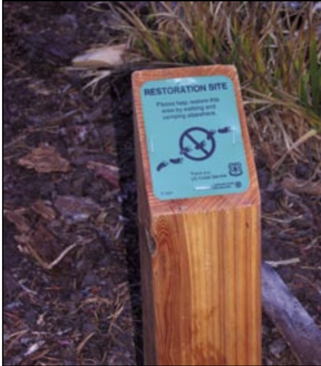
Figure D-6—Restoration closure signs helped deter use at closed sites.