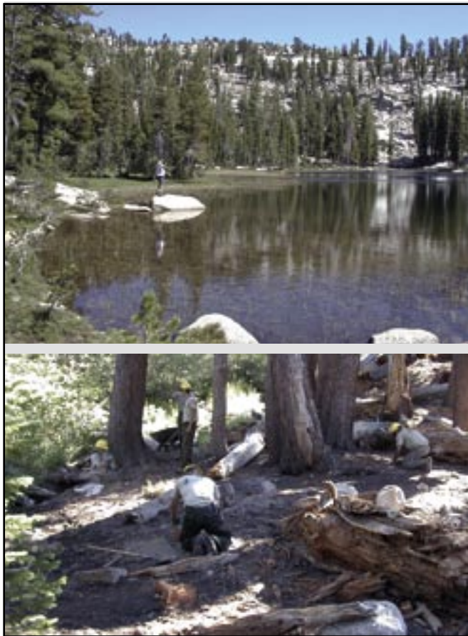
Figures D-4a and 4b—Ease of access to Grouse and Hemlock Lakes (top) in the Desolation Wilderness, CA, led to extensive impacts (bottom).

Grouse and Hemlock Lakes (figures D-4a and 4b) are located in the subalpine zone at 8,200 to 8,400 feet (2,499 to 2,560 meters) in the Crystal Range of the Sierra Nevada Mountains. The dominant tree species include lodgepole pine, mountain hemlock, and western white pine. The