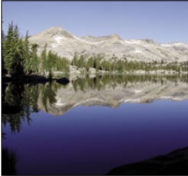
Figure D-14—Lake of the Woods in the Desolation Wilderness, CA.