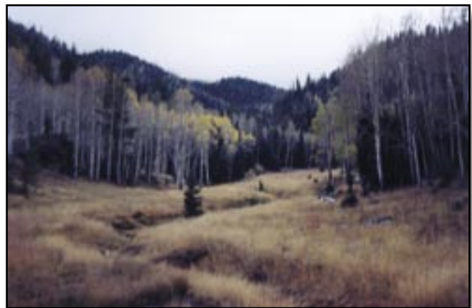
Figure D-7—Mill Flats had substantial changes in vegetative composition because of overgrazing. Restoration involved improving management of grazing. No active revegetation was needed.

Mill Flat (figure D-7) is a pleasant mountain meadow that has always provided livestock respite from the summer heat at lower elevations. Recreational livestock and permitted