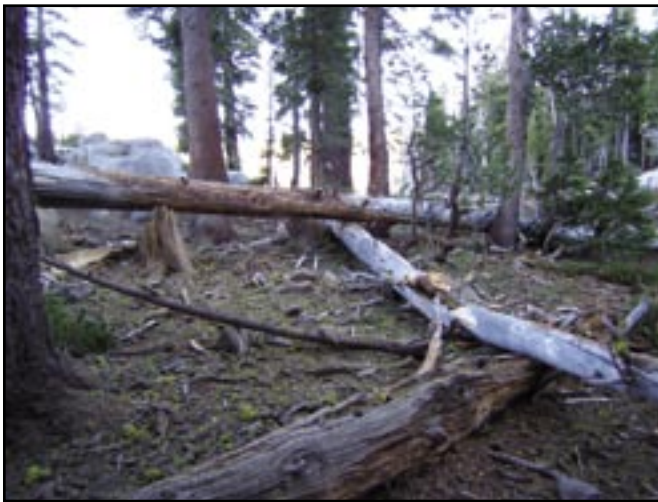
Figure D–18b—After blasting was complete, the campsite had a natural appearance and the fallen logs discouraged camping on the restored site.