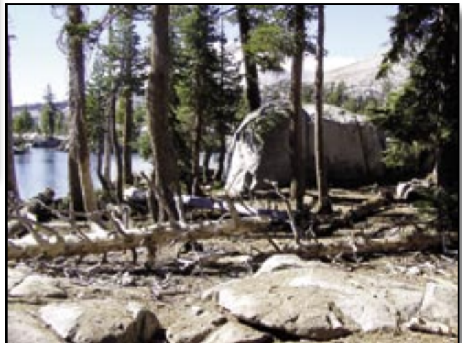
Figure D-16b—Snags were directionally felled by blasting to provide some ground cover and discourage use.