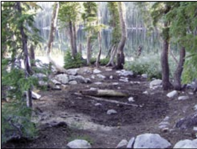
Figure D-15b—Campsites in undesirable locations were restored to natural conditions.

Some vegetation was transplanted—with limited success. Because hazard trees had not yet been eliminated, campsites could not be designated before the restoration work was completed. Some obvious campsites were left open to encourage visitors to camp there instead of at the restoration sites.