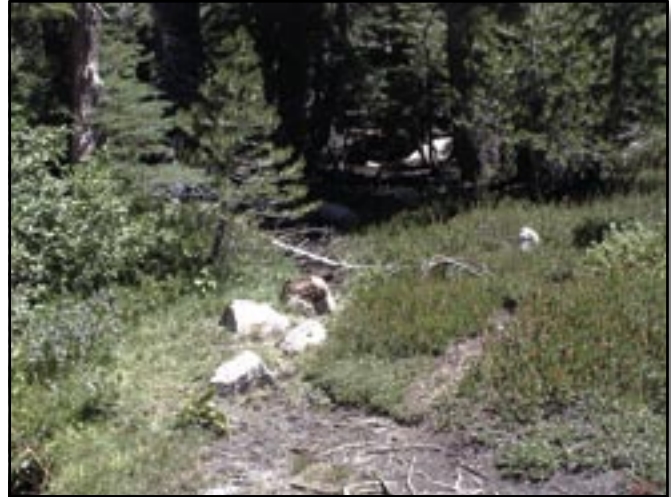
Figure D-5—Rocks and logs were installed on social trails and closed campsites to deter use and provide microhabitat for plantings.