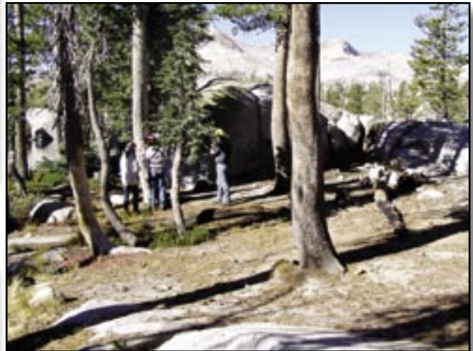
Figure D-16a—Several campsites merged into one large campsite. Rocks and logs to restore the site's natural appearance were in short supply.

merged into one large campsite) and rocks and logs to restore the site's natural appearance were in short supply, snags were directionally felled by blasting to provide some ground cover and discourage use (figures D-16a and 16b).