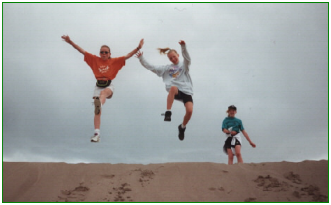
Great Sand Dunes Wilderness, Colorado

FREEDOM TO...hike...explore...run...jump...find peace...ride a horse....play...listen to birds...see wild animals...take photographs...watch the sky...hear the wind...challenge yourself...rest...learn...camp...study the stars...find wildflowers...stroll...meditate...rejuvenate...feel the weather...get lost (and find yourself)...listen to frogs...enjoy the scenery...glide in a canoe...dip in a cold stream....fish in a lake...discover mushrooms...share nature with family and friends...chase clouds...hear a tumbling waterfall....and freedom for nature to be wild!